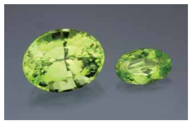
Figure 2. This diopside (3.39 ct) and amphibole (probably tremolite, 0.63 ct) were cut from two yellowish green crystals recovered from Merelani.

studied two gemstones (0.63 and 3.39 ct) that were cut from Mr. Ulatowski's stock (figure 2). Gemological properties and various types of spectra (visible-near-infrared, Raman, and energy-dispersive X-ray fluorescence [EDXRF]) were collected on the faceted stones at GIA by one of us (EAF). Electron-microprobe analyses (Cameca SX50 instrument,15 kV accelerating voltage, 10 nA current, 10 mm defocused beam, natural mineral standards) and singlecrystal X-ray diffraction analysis were performed on the amphibole crystal at the University of Arizona; this sample was donated by Mr. Ulatowski for inclusion in the RRUFF Project (ID no. R070422 at http://rruff.info).