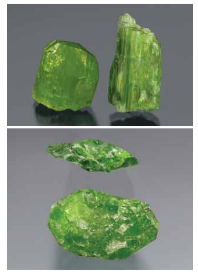
Figure 1. These yellowish green crystals were recovered from Block D at Merelani in the latter part of 2005. A blocky morphology is shown by the diopside crystal (1.6 cm tall; left and bottom), whereas the tremolite crystal has a flattened, diamond-shaped cross-section.

Mr. Ulatowski loaned one example of both types of crystals to GIA for examination (figure 1), and we also