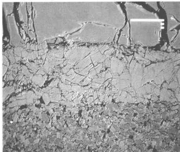
Fig. 2. Backscattered electron image of an experimental product from melting experiments with carbonate flux (expt. 1898, 13 GPa, 1950 °C). Shown in the sequence with decreasing temperature from the top is the melt, preserved as brown transparent glass, a layer of Ca 2 SiO 4 , produced by incongruent melting and segregated from the melt, and the subsolidus assemblage of Ca 2 SiO 4 + CaSi 2 O 5 at the bottom. The scale is 100 μm long.

The observed large pressure dependence of the melting