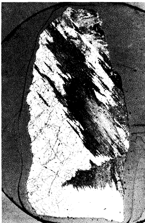
FIG. 1. Esperite (dark) replacing hardystonite (light) along cleavage planes and fractures (NMNH 144877). Maximum dimension of sample is 25 mm.

The most common and texturally interesting of the associated minerals is hardystonite, \text{Ca}_2\text{ZnSi}_2\text{O}_7 , a member of the high-temperature melilite group. Although hardystonite occurs without esperite in many parts of the Franklin orebody, the northern end of the mine, where esperite occurred, contained much hardystonite in intimate association with esperite. In thin-section (fig. 1), esperite replaces hardystonite along fractures and cleavage traces; this replacement gives rise to a 'feathery' interface between the two species, as observed in hand-specimens. In addition to hardystonite, hodgkinsonite, \text{MnZn}_2\text{SiO}_4(\text{OH})_2 , occurs with esperite, frequently forming at the interface between hardystonite and esperite. Where hodgkinsonite is present between these species, it is crystallographically parallel to the fibrosity of the esperite aggre-