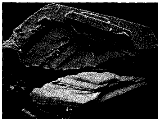
FIG. 1. Scanning electron photomicrograph of a broken juabite platy aggregate which shows the perfect {010} cleavage. (Scale bar: 50 \mu\text{m} ).

Juabite masses are gemmy emerald-green; thin crystals are a very much lighter green. The streak is pale green. The lustre is vitreous to adamantine on