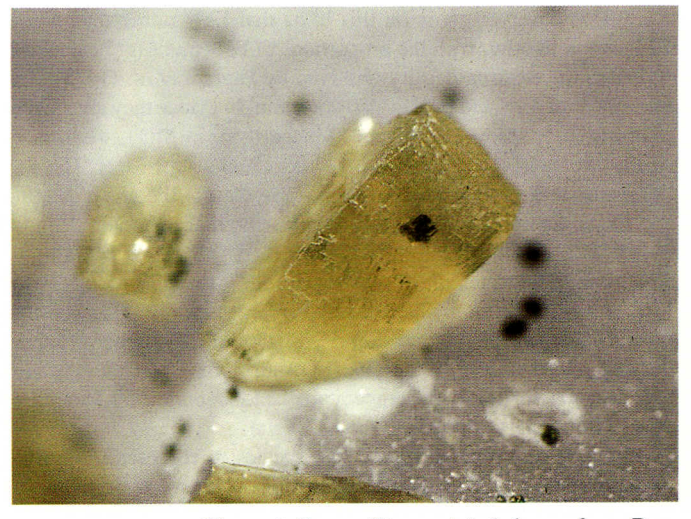
Figure 5 . Zanazziite crystal, 1.4 mm, from Brazil. NMNH #155707.