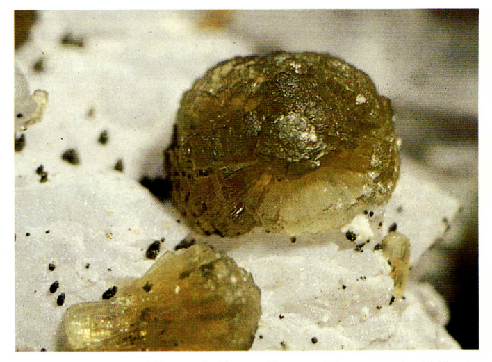
Figure 4. Zanazziite crystal aggregate, 2.8 mm across, from Brazil. USNM #155707.