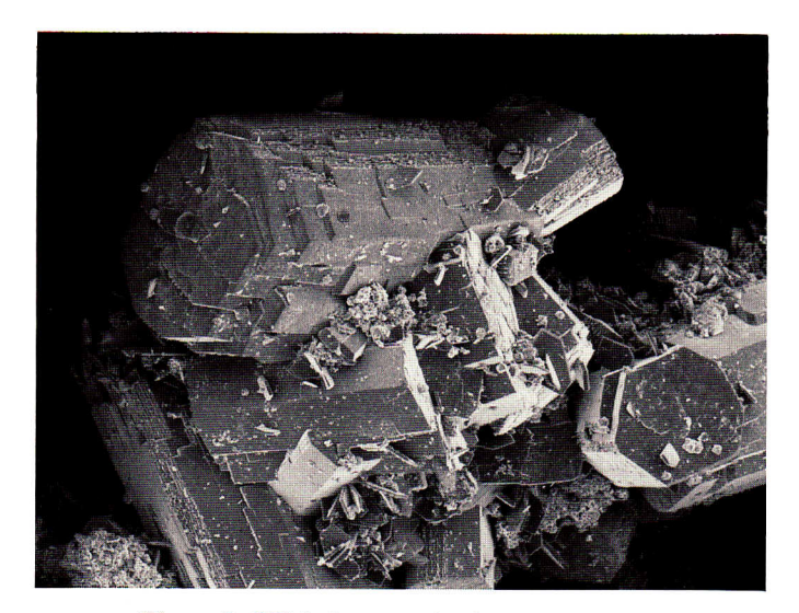
Figure 1. SEM photograph of zanazziite crystals, showing the common pseudohexagonal morphology. The largest crystal is about 0.4 mm in length. NMNH #R17847.

In addition to the large, cloudy quartz crystals, other minerals earlier than zanazziite in the pockets are albite, muscovite, rose quartz in crystals, and wardite. Eosphorite is roughly contemporaneous with zanazziite; even after careful study, the temporal relationship remains obscure. Eosphorite occurs in crystals, usually similar to those of zanazziite in size, but sometimes much larger. They are elongate, transparent and golden brown in color, and occur in individual crystals, sprays, and druses. Other late minerals include apatite crystals in small radial clusters, pyrite, which forms minute druses on zanazziite and tiny isolated crystals and crystal groups on eosphorite, albite, and Mn oxides in thin films and smudges.