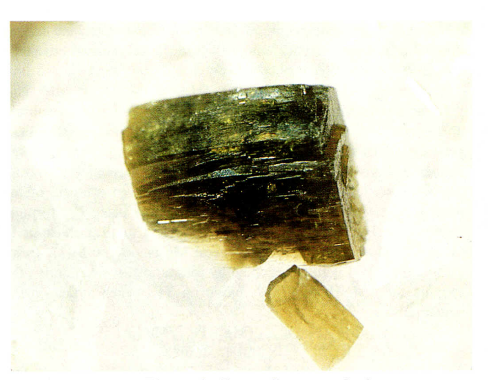
Figure 3. Zanazziite crystal, 4 mm, on rose quartz, from Brazil. USNM #154810.

Figure 2 . Graph showing results of microprobe scans for Ca, Mg, Fe, Mn and Al across a zanazziite crystal, NMNH #R17847.