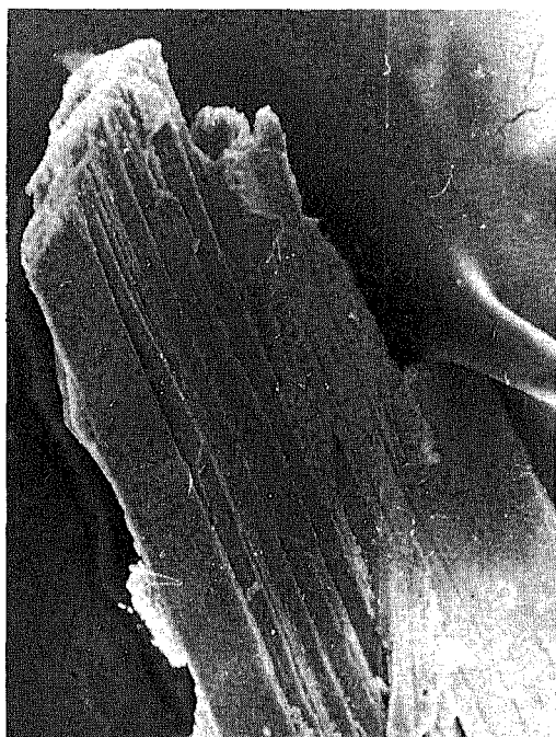
Fig. 3. — Shape of the cannizzarite crystals. 750 x. Scanning microscope J.S.M. - T - 20.

After the paper of GRAHAM et al. (1933) cannizzarite was listed again in handbooks as a valid mineral species (STRUNZ, 1978) but its formula was considered as doubtful, and only galenobismutite and bismuthinite were reported in its association (VV.AA., 1960). As we know, no new analysis of type cannizzarite are available.